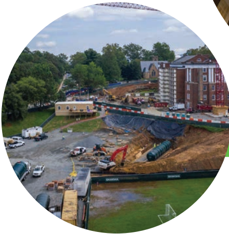
Cisterns buried in Nameless Field hold 75,000 gallons of stormwater runoff.