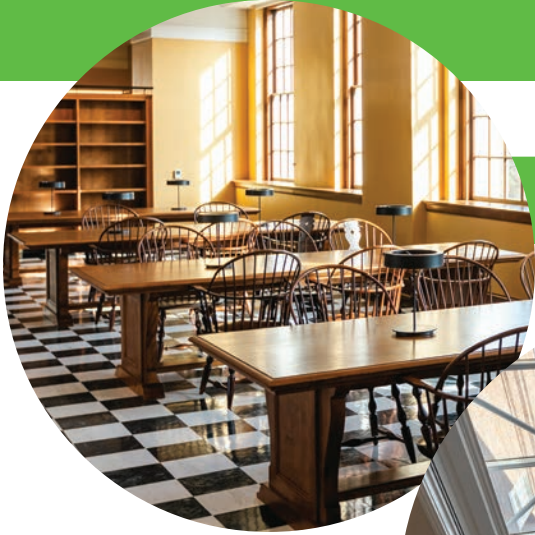
Historic furniture, bookshelves, and period fixtures were restored and refurbished.