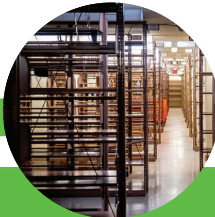
More than 120 tons of metal shelving were recycled.