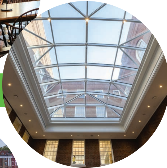
Windows, skylights, and a rooftop clerestory allow natural light to flow through the building.